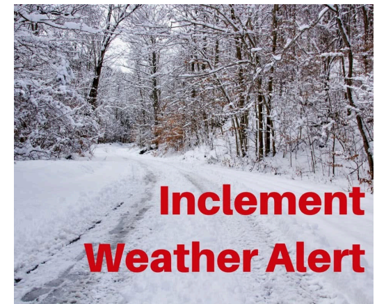
Inclement weather days: February 11 & 12 and 19 & 20